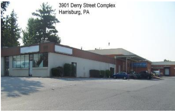
3901 Derry Street Complex Harrisburg, PA