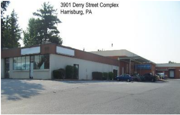
3901 Derry Street Complex Harrisburg, PA