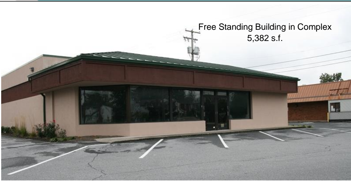
Free Standing Building in Complex 5,382 s.f.